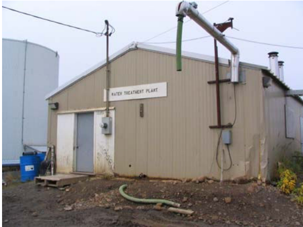
Figure 1. Water Supply. Water Intake and Treatment Facility.