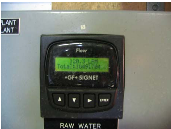
Figure 3. Water Supply. Water intake meter.