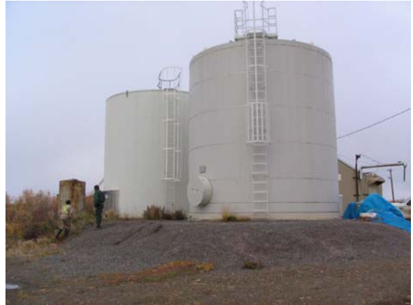
Figure 2. Water Supply. Raw and treated water storage tanks.