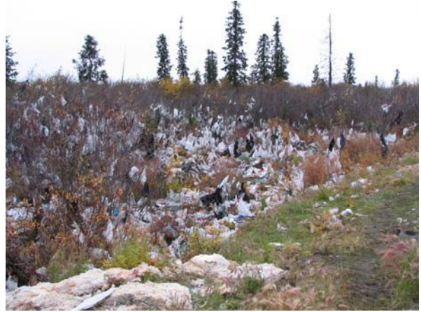
Figure 10. Waste Disposal. SWDF. To the south of the domestic waste disposal area.