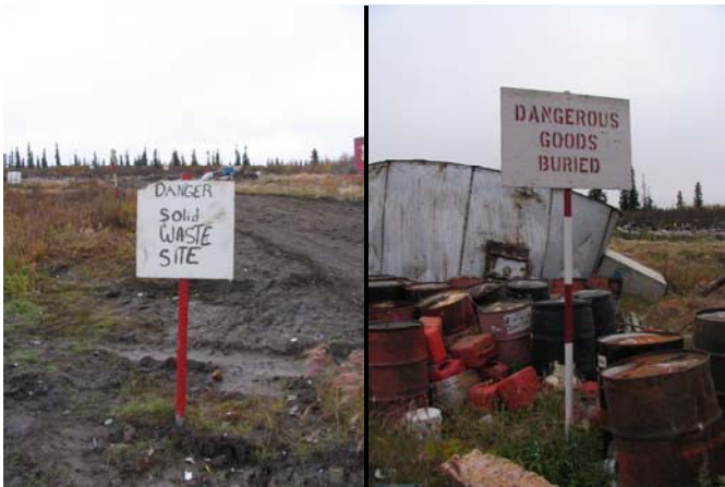
Figure 11. Waste Disposal. SWDF signage (warning), and hazardous wastes/waste oil disposal area.