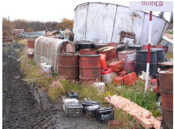
Figure 12. Waste Disposal. SWDF hazardous wastes/waste oil disposal area.