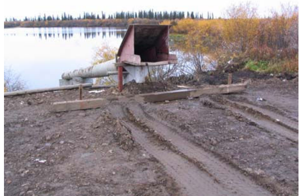
Figure 4. Waste Disposal. Sewage Lagoon raw sewage discharge culvert.