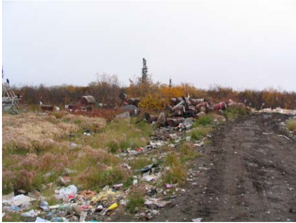
Figure 9. Waste Disposal. SWDF empty barrels.